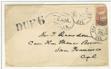
26 July 1864 San Francisco, California and Steam Panama handstamp 10c steamship rate partially prepaid by 3c adhesive, should have been rated as due 7c "Due 6" handstamp applied incorrectly