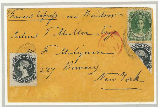
5 December 1861 Halifax to United States, endorsed "Favors Express via Windsor" 10c rate repaid with 8 ½c plus single and bisected 1c