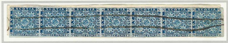
The A series cancels, numbered from A91 to A98, were used on Atlantic Mails Boats from June, 1859.