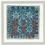
red "10" cancel